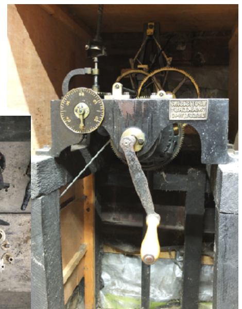
the clock as it was, with winding handle