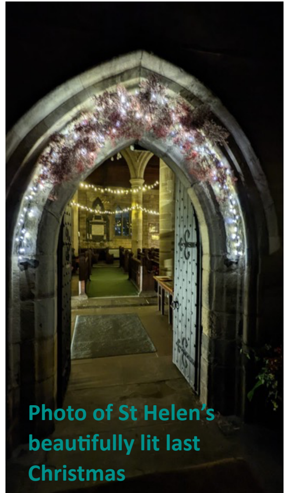
Photo of St Helen's beautifully lit last Christmas