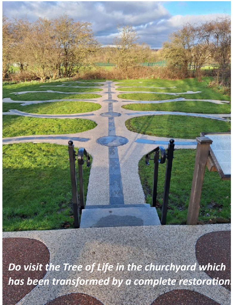
Do visit the Tree of Life in the churchyard which has been transformed by a complete restoration

Among the items we have been able to fund, knowing that we could afford to go ahead: Gutter cleaning, organ repairs, repair of heaters, upgrading the alarm system, new bell ropes, cutting back