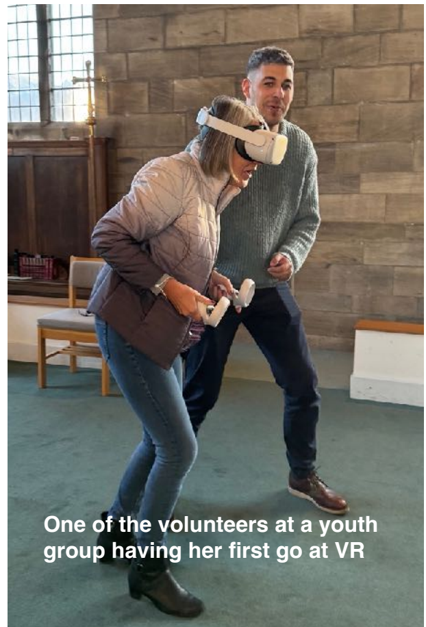
One of the volunteers at a youth group having her first go at VR