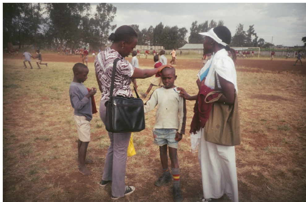
Photo of a school in Siaya, Kenya