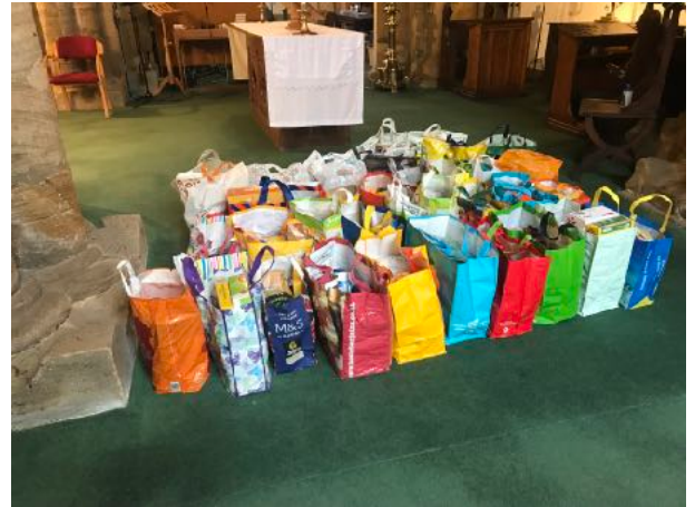
These photos show the Harvest collection of 42 bags of food which was split between Sandal Castle School and St. Catherine's Food Bank.